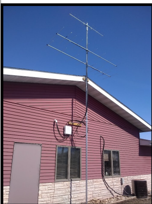
MOTUS tower on the back of BCCB building.

The station near the town of Early, on the Black Hawk Wildlife Unit building, has had a lesser yellowlegs tagged at its wintering grounds in Columbia. The lesser yellowlegs was tagged in Columbia on April 19, 2022. It was detected in southern Costa Rica on May 4, 2022 traveling an estimated 48.5 miles per hour. Then it was detected in Kansas on May 7, 2022 and again on May 7, 2022 at the Missouri River Wildlife Unit for two minutes. Finally it was at the Black Hawk Wildlife Unit for five seconds.